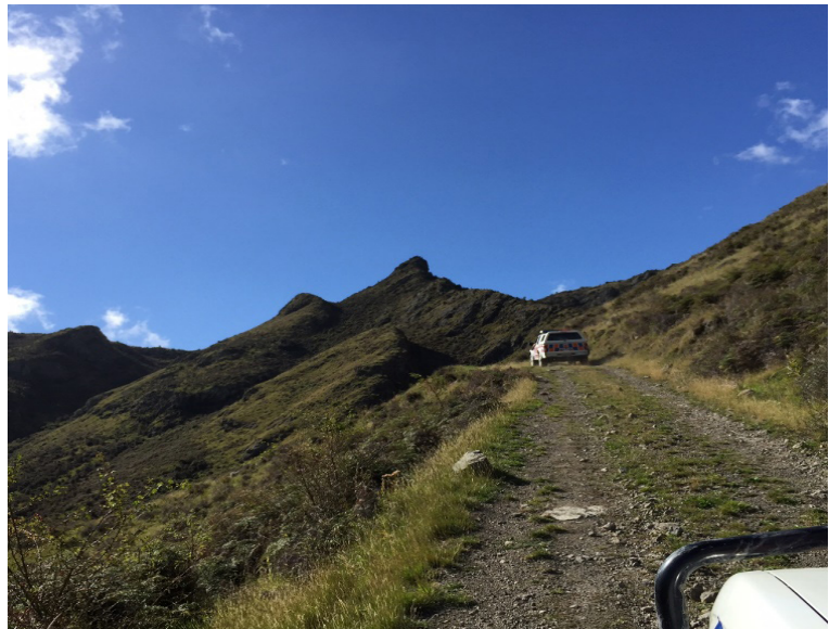
SAR team driving through the RAMSHEAD area from Waihopai to Awatere valley.