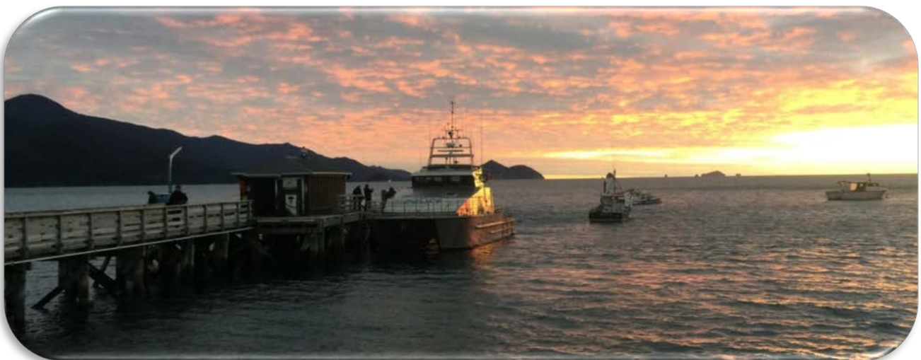
AOS staff disembarking 'Lady Liz' at French Pass after dealing with the incident on D'Urville Island.

This incident turned out well in the end but could have easily gone the other way.