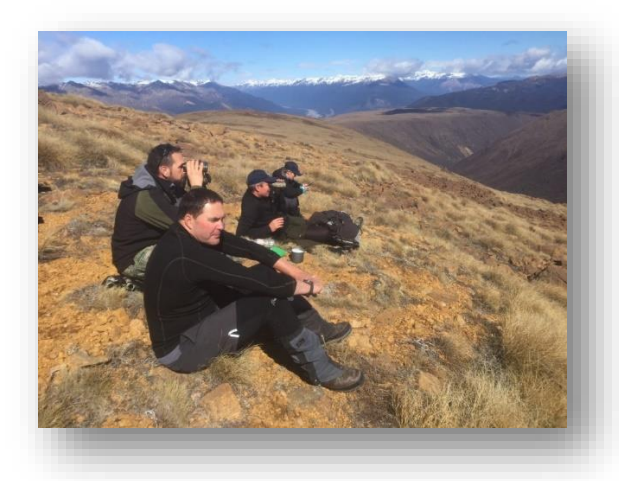
Some of the SAR team taking a break on Red Hills.

This is part of the familiarisation Police SAR do with the Navy so that they can work together during emergencies and disaster response.