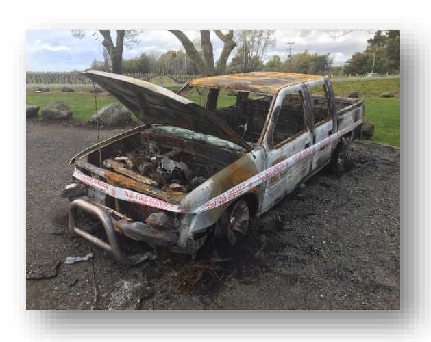
Do you know who owns this vehicle?

The ute was set alight and dumped this Sunday 15 September at the parking area next to the bridge on Hawkesbury Road, near Renwick.