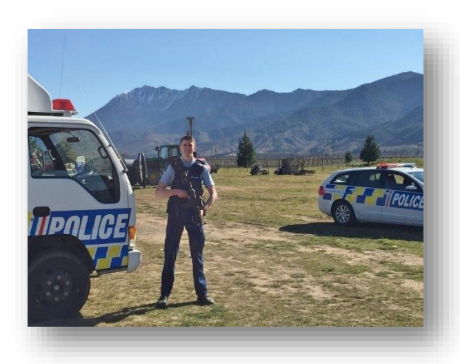
A Blenheim Police Officer guarding the scene of the Methamphetamine lab in Wairau Valley.