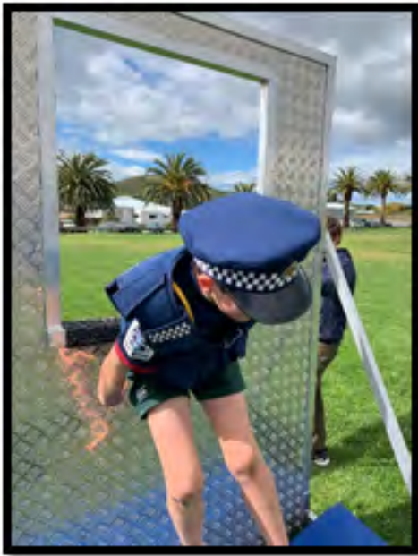
Two young participants going through the 'window' as part of the Police PCT course at the Awatere Memorial Hall Opening event.

We saw great technique and determination shown by those who tried it. Many parents were pleased to see their young people making several attempts at the course and burning off energy, assuring their parents of a quiet evening and some sound sleeping.