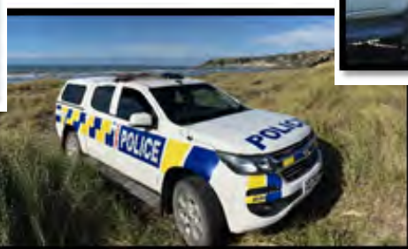
Patrolling Marfell's Beach area