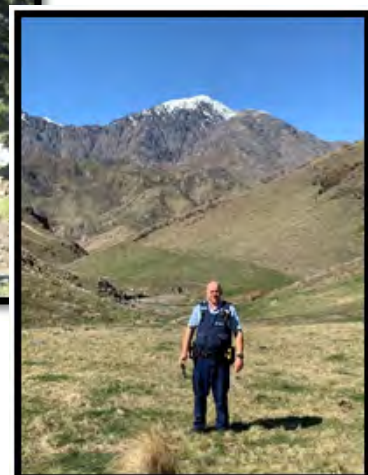
Leighton in Awatere Valley