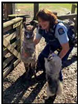
Amy & friends