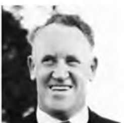
Detective Inspector Wallace Chalmers, QPM Detective Inspector No 3664 Died: 6 January 1963 Age: 46 Stationed: Auckland

Shot dead at Bethell's Road, Waitakere, while attending an armed incident.