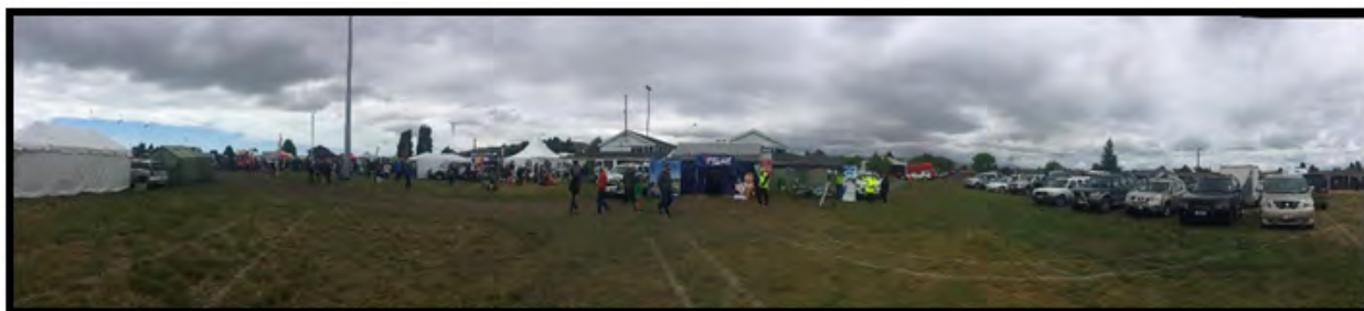
Police site at the Marlborough A & P Show in November 2018

We will be there again this year. It will be a busy week and weekend for us as some of the team are working at the 'Gun Buy Back' at Picton and Kaikoura the Saturday and Sunday as well!