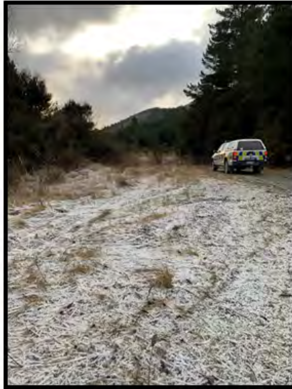
Police Crime Prevention staff driving through Leatham Valley on a cold morning in July.