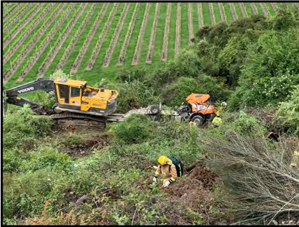
One of the Seddon Fire crew climbs back up the bank from the truck.

A fantastic job was also done by the Seddon Fire crew, Ambulance crew and also the Nelson Marlborough Rescue Helicopter.