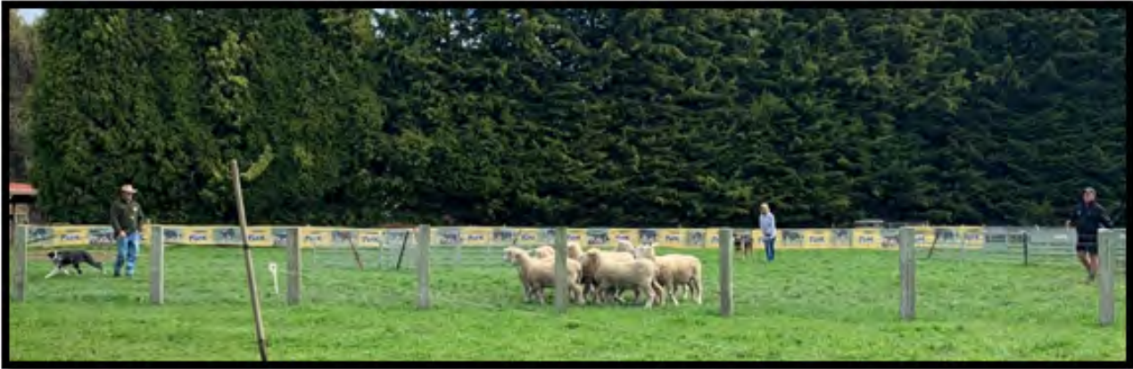
Another great event run at 'Richmond Brook'.

amazing display put on by well-trained and talented dogs and trialists... well, some anyway! There were threats to leave some dogs tied to fences after dismal performances by the dogs... or was it the trialist or flighty, spooked sheep? You'll be pleased to know that no dogs were reported abandoned at the event!