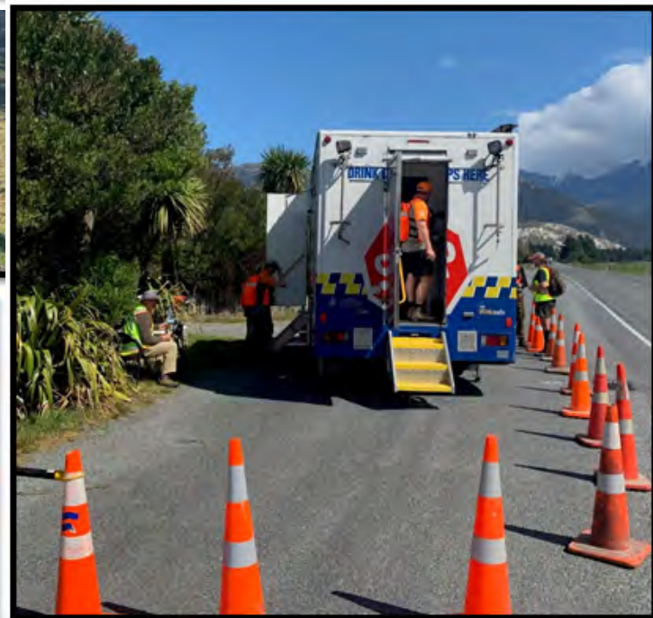
Left: Leighton taking a break from a search of the beach while using a 4x4 Quad bike.

LAND SEARCH & RESCUE New Zealand | Rapa Taiwhenua