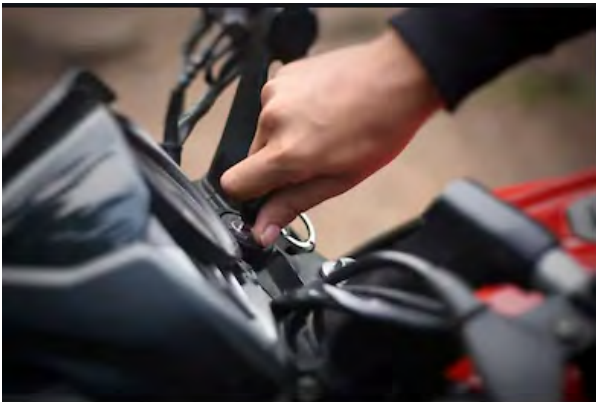
Always remove & put the vehicle keys somewhere safe when you park it up.

Please consider removing the keys to your vehicles and stashing them somewhere they are not easily found.