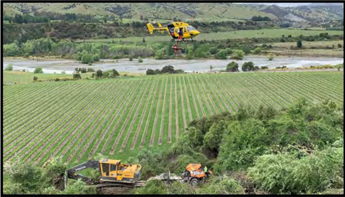
Helicopter crew hoist the driver to their machine in preparation for the flight to hospital.

On the 28th of October a heavy hauler truck slipped off an access road and rolled about 60m over a bank in the Awatere. At the time the driver was bringing a 25-tonne excavator down the hill on a low loader.