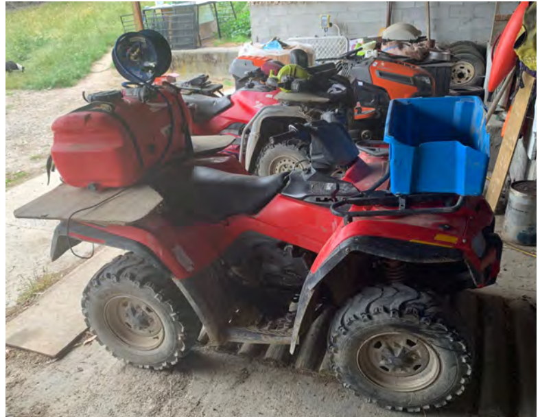
The stolen bike recovered near Weld Pass.