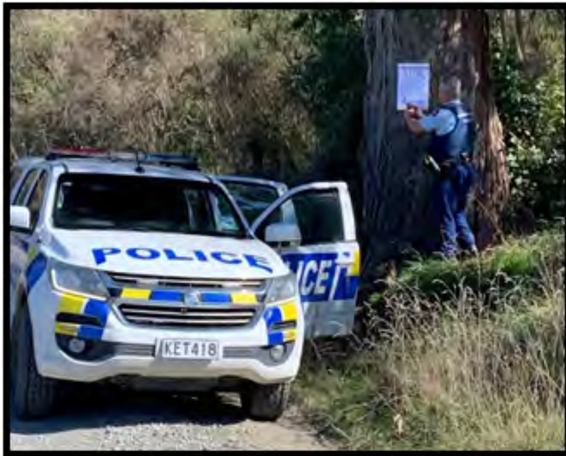
Tim putting up more signs

We have all been out and about putting up poaching signs and have also given a bunch of them to DoC whose staff have used their networks to distribute them - this is helping to further get the message out there.