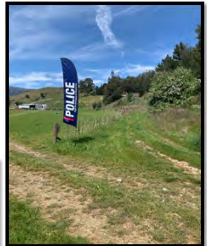
The entrance to 'The Guardian' Woolshed