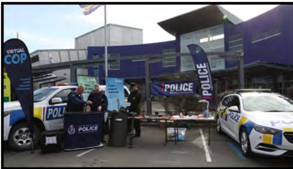
Left: The Police display at the Future of Work Conference

The objective was to open the eyes of our local young people to the incredible opportunities that exist on their doorstep and for all Marlborough youth to discover a purposeful pathway after they finish school.