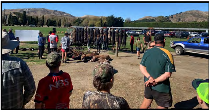
Hunters, their families and onlookers check out the entries in the Flaxbourne Pig Hunting competition.