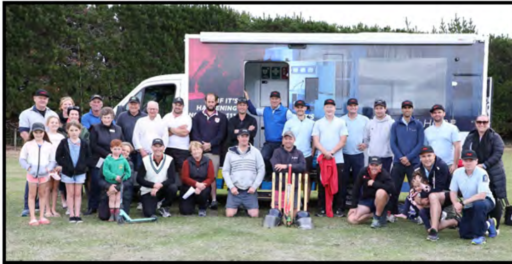
The FFlaxbourne cricket team and the local Police cricket team.