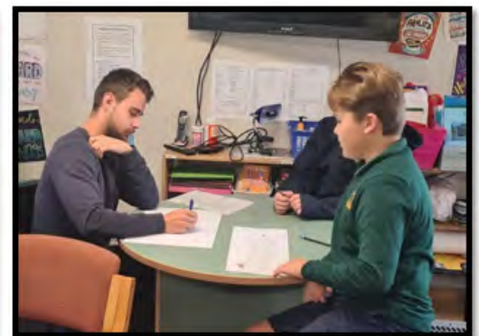
SSharing ideas with the art team from Youth Trust.