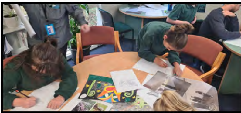
Seddon students creating art for the walkway.