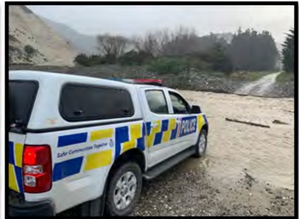
Waipapa after the heavy rain that fell earlier in in June 2021