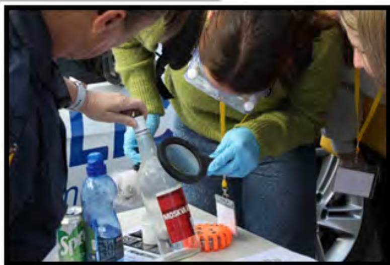
Students try their hand at forensics - fingerprinting.

The young people attending the conference had keynote speakers sharing stories of inspiring possibilities.