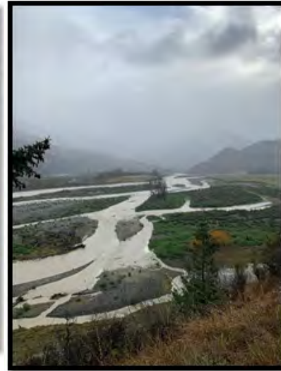
Waipapa after the heavy rain that fell earlier in June 2021