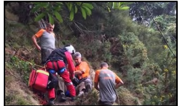
Marlborough SAR in the bush assisting the injured hunter

The rescue was heavily reliant on someone hearing him, and this is a valuable reminder to ensure emergency communication is always at hand when you are out-and-about in remote areas.