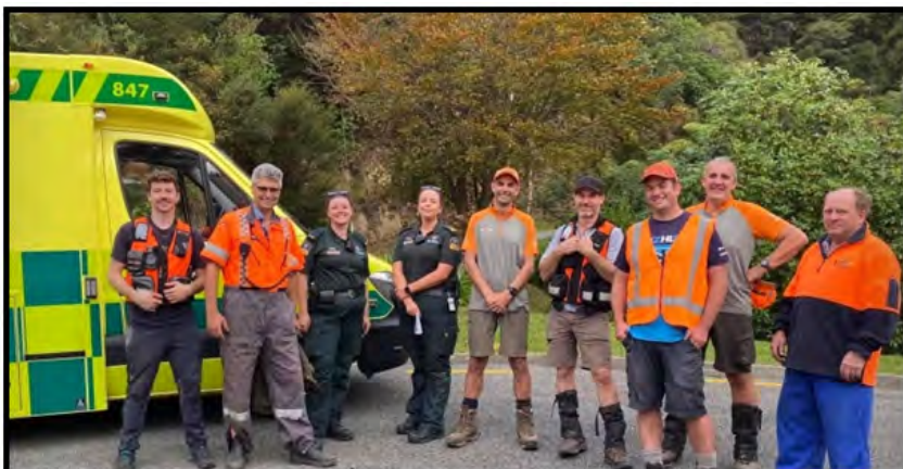
Left: Some of the SAR and Ambulance team that assisted in the rescue of the hunter.