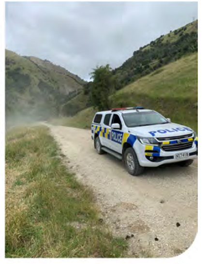
Marlborough Rural Police patrolling the Kekerengu & Ure Valleys