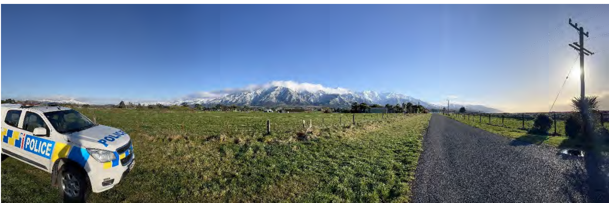
Winters day in Kaikoura