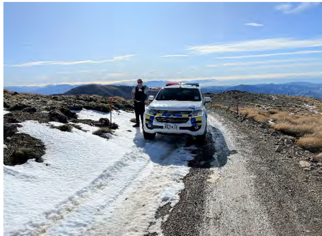
Sean in the snow while out on patrol.