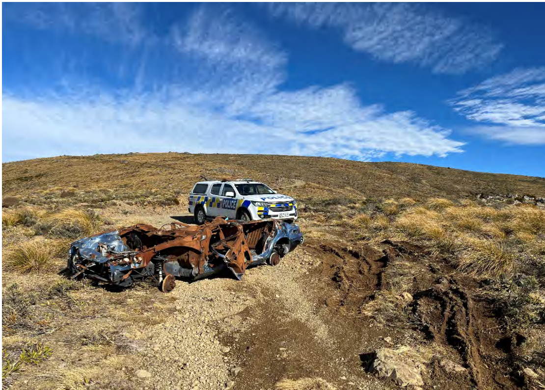
The rural team check out a car wreck on Altimarlock