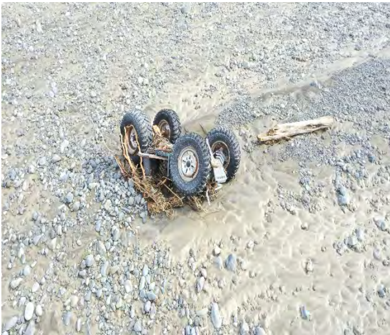
This quad has seen better days! Was likely washed away in the winter floods